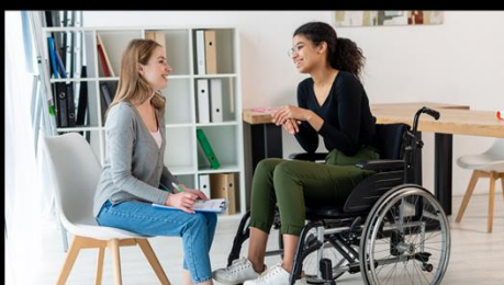
DISABILITY SKILL SET